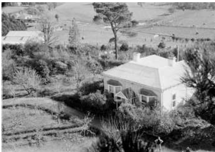
Heide 1949

The exhibition will celebrate the influential role of Heide founders John and Sunday Reed in the development of Australian art and intellectual culture from the 1930s right up to the early 1980s.