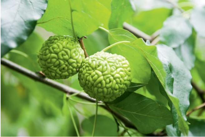
[Question 12]