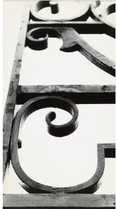
Carol Jerrems G from the Alphabet Folio (1968) dated 1969 1 of 25 gelatin silver photographs 19.1 x 11.5cm National Gallery of Victoria, Melbourne Purchased 1971

Carol Jerrems was an impassioned photographer of social relationships in the 1970s, an era intoxicated by the ideals of free love, youth and beauty but also touched by social conflict and violence. Influenced by feminism and with an instinctive empathy for subcultures and dispossessed groups—especially Aboriginal communities—Jerrems was interested in photography's socially restorative capacity. 'This society is sick and I must help change it', she said.